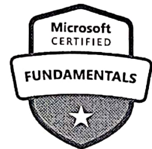
Satya Nadella Chief Executive Officer

A handwritten signature in black ink, appearing to read "N. Satya".